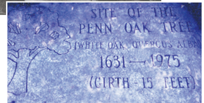
Marker designating site of the former Penn Oak tree

around both sides of the plaza. The developer rejected this proposal, but did cooperate with the committee by building a macadam (instead of a more harmful concrete) sidewalk around the tree, and donated $100 to the care and maintenance of the tree. The developer also took advantage of their newfound publicity by naming the development Penn Oak Manor. The committee agreed to take on responsibility for all care of the tree going forward, raising money as needed over the years to address items such as pruning and termite and fungus removal.