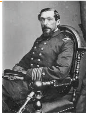
Captain Percival Drayton