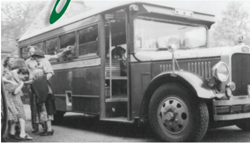
Carson 1 – Carson Valley teachers and students c. 1930s