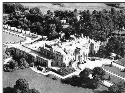
Views of Whitemarsh Hall