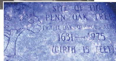
Marker designating site of the former Penn Oak tree

around both sides of the plaza. The developer rejected this proposal, but did cooperate with the committee by building a macadam (instead of a more harmful concrete) sidewalk around the tree, and donated $100 to the care and maintenance of the tree. The developer also took advantage of their newfound publicity by naming the development Penn Oak Manor. The committee agreed to take on responsibility for all care of the tree going forward, raising money as needed over the years to address items such as pruning and termite and fungus removal.