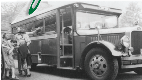
Carson 1 – Carson Valley teachers and students c. 1930s