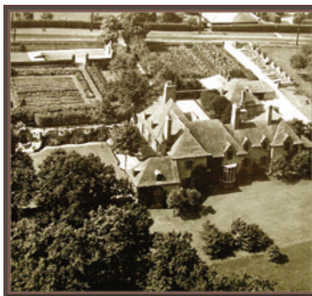
Ropsley, commonly known as the "Poe House"