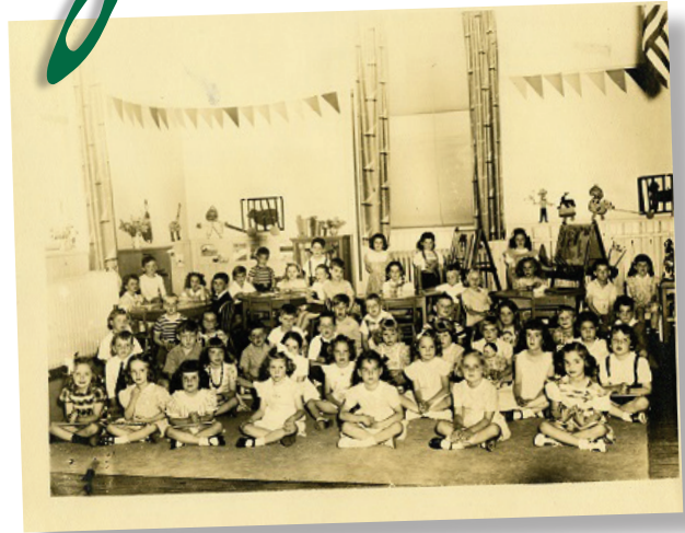
Photo of Wyndmoor School kindergarten class 1947-1948