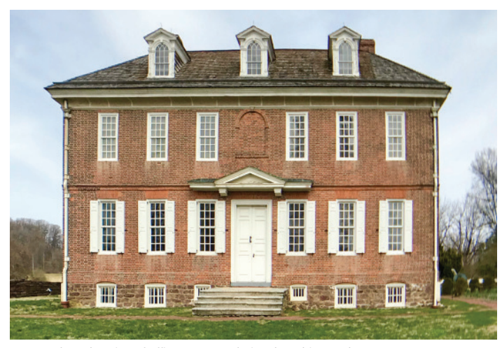
Hope Lodge – location of officer quarters during the Whitemarsh encampment, November/December, 1777.

Last spring (2017), students of Phil-Mont Christian Academy in Erdenheim completed and produced an online driving tour of the Battle of Whitemarsh. The tour can be found at Battleof-Whitemarsh.weebly.com. The project, which was begun in May of 2016 by the 11th Grade AP US History class and completed the following May, was presented to a public audience at that time. Many people attended including members of the Springfield