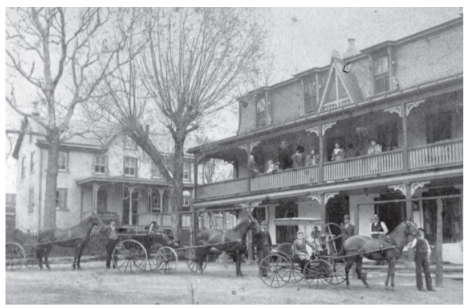
This 1885 photo shows three horse and carriages and people can be seen standing on the first and second floor porches.

Acoustic performance by Revolving Doors featuring the Page Brothers, Greg & Chris (Spaj)