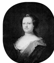
Painting by Benjamin Wilson, 1759, from the Collection of the American Philosophical Society, Philadelphia.