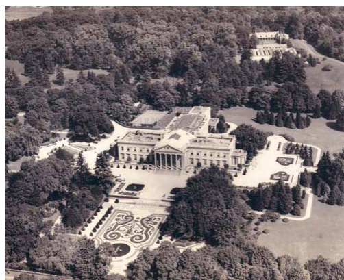
◀ Lynnewood Hall, Elkins Park, Horace Trumbauer, architect.