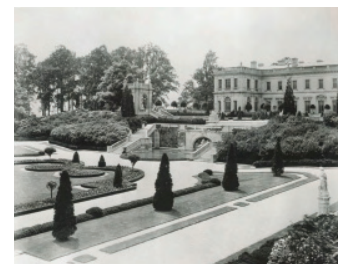
▶ Two views of Whitmarsh Hall, formerly in Wyndmoor, Horace Trumbauer, architect.