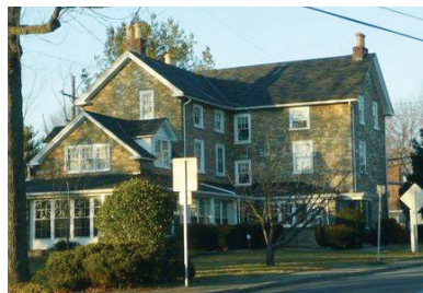
Stone House used as the office for Enfield Pottery and Tile Works, Paper Mill and Church Roads