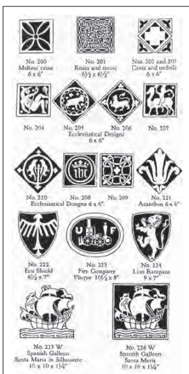
◀ Enfield Tiles from 1928 catalogue, Enfield Pottery and Tile Works, Price List of Floor and Wall Tiles.