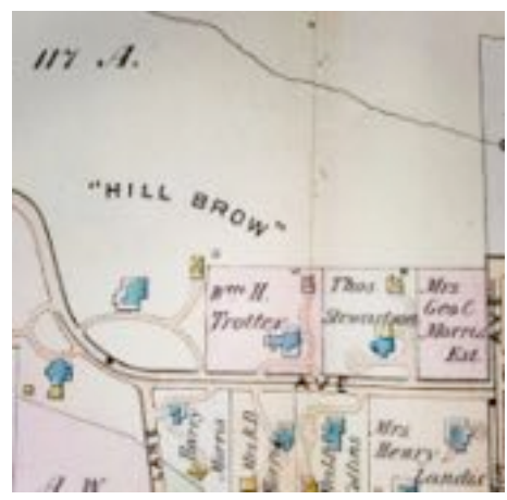
A.H. Mueller 1897 Map showing location of "Hill Brow"

For anyone interested in reading more, the news articles can be found here: