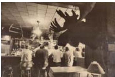
The moose that adorns the dining room wall at Cisco's Bar and Grille is as popular as the cheese steak hoagie with members of the Flourtown community.