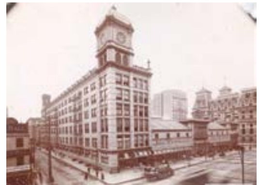
Wanamakers Depot