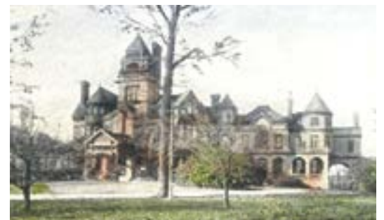
Lindenhurst postcard

Please join us on December 4th to explore the exciting lives of this prominent local family. The public is invited to attend, and there is no charge for admission. Reservations are not required. Light refreshments will be served.